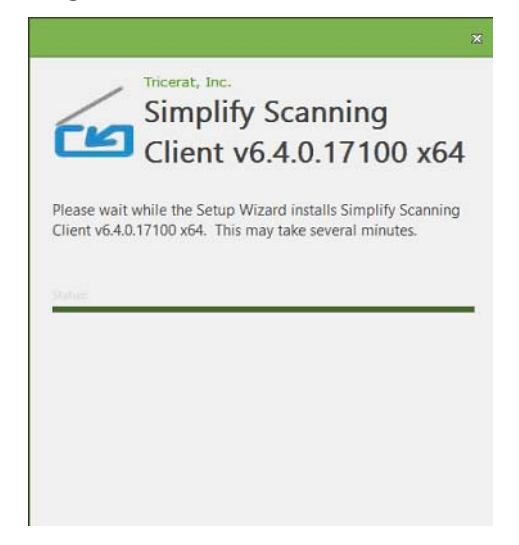
Figure 2-11: Simplify Scanning Client Installation wizard, Installation Progress page

Figure 2-10: Simplify Scanning Client Installation wizard, Installation Progress page