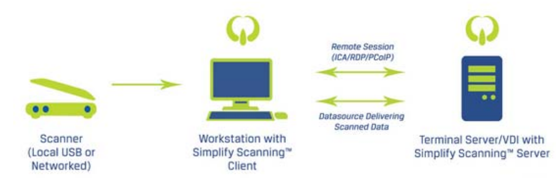
Figure 1-1: Simplify Scanning infrastructure

Figure 1-1 below details the two scenarios for using Simplify Scanning.