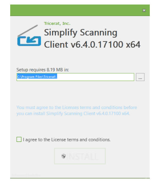
Figure 2-9: Simplify Scanning Client Installation wizard, License Terms and Conditions page

The Simplify Scanning Client Installation wizard opens. The License Terms and Conditions page is the open page.