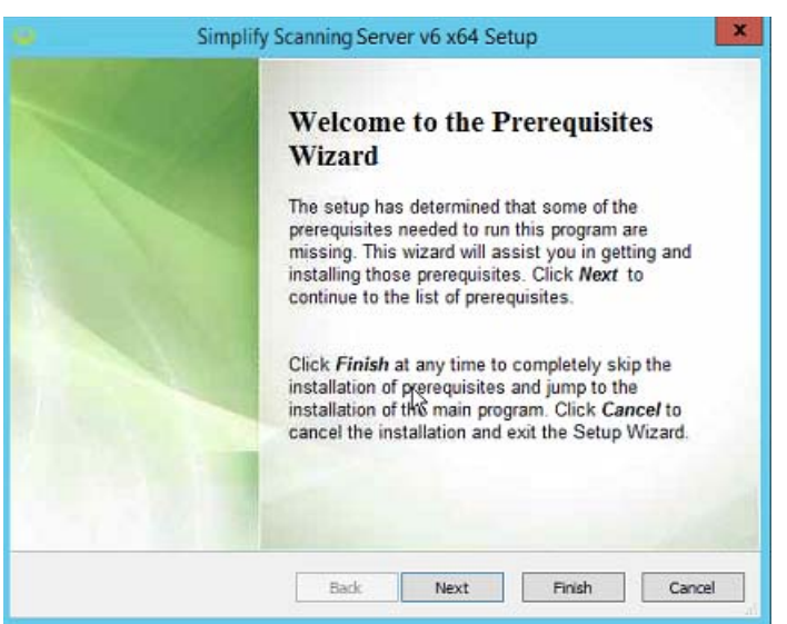
Figure 2-2: Simplify Scanning Server Prerequisites Wizard, Welcome page